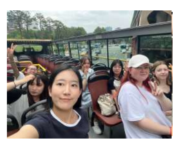
City Tour Bus