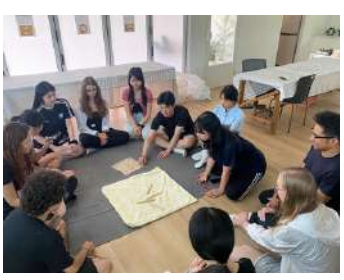
Korean traditional game